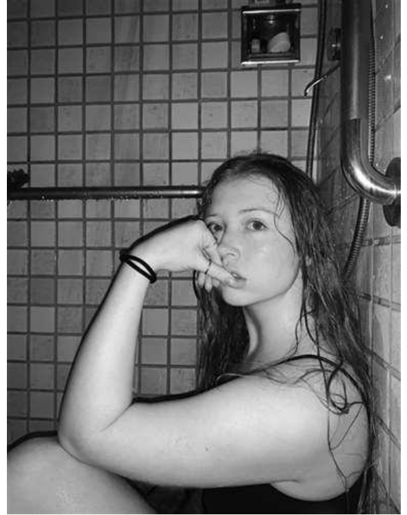
“Drenched” Honorable Mention