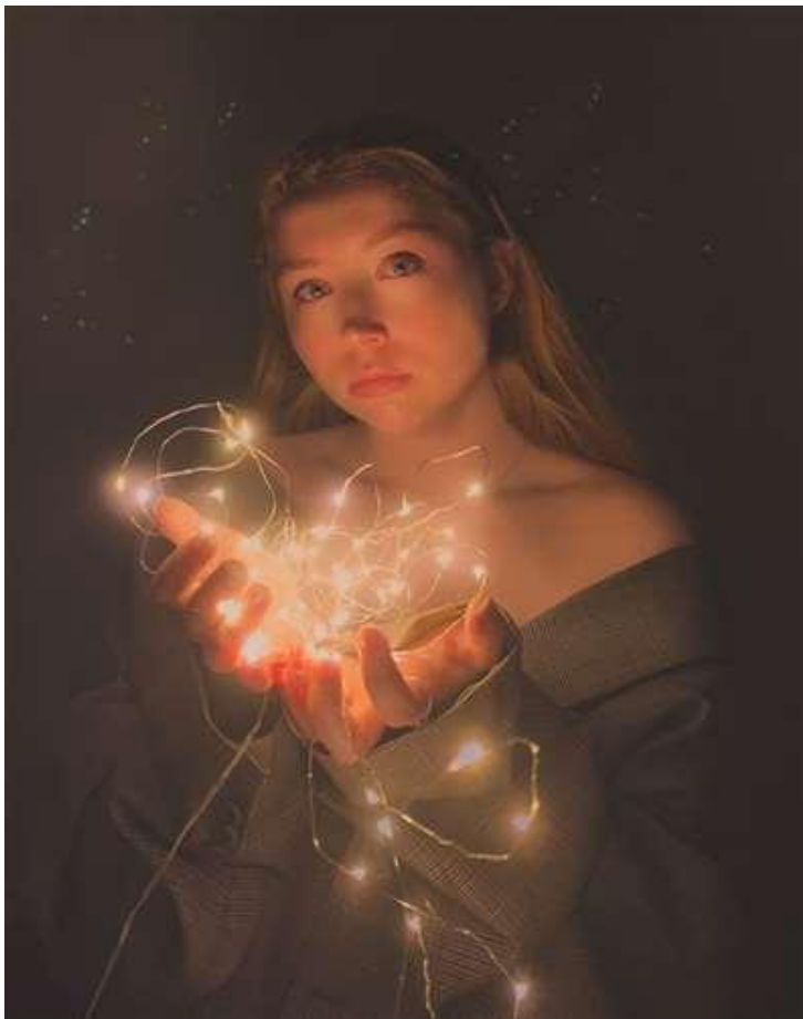
“Faerie” Gold Award