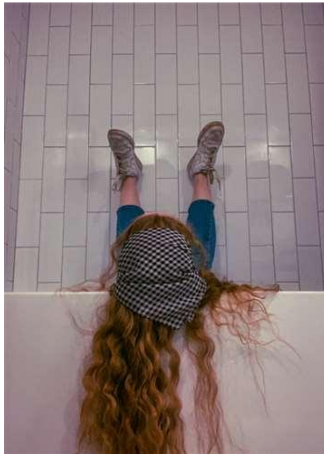
“Bathtime” Silver Award