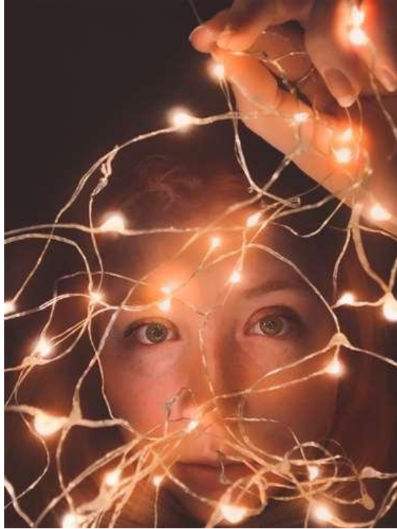
“Synapse” Honorable Mention