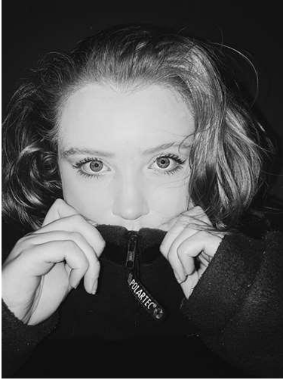
“Seen” Honorable Mention