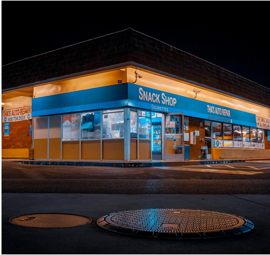
“GAS” Gold Award